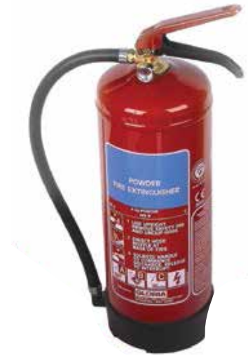
(Extinguisher not included)