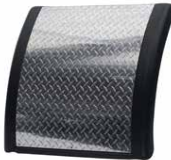
Aluminium diamond plate